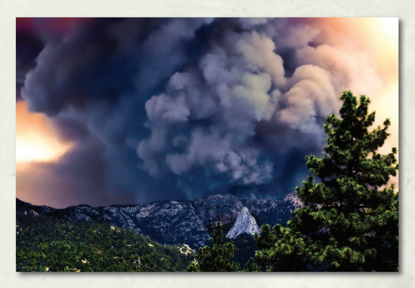
The Mountain Fire rages behind Tahquitz Peak