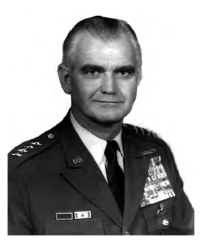
General William C. Westmoreland, Commanding General of MACV and U.S. ground forces in South Vietnam, 1964 – 1968.

In 1962, the Military Assistance Command Vietnam (MACV) was created as the Command and Control element for an ever-increasing volume of equipment, military advisors, technicians and staff to manage rapidly growing efforts to support the tottering Saigon Government. Although MACV's stated mission was to serve as an extension of the diplomatic mission, and as an allied headquarters, when the first major U.S. units arrived in Vietnam (1965), General William C. Westmoreland and his top military commanders became mired in a quandary. This wasn't like fighting in Europe and Korea. They hadn't been trained to fight in Vietnam's terrain,