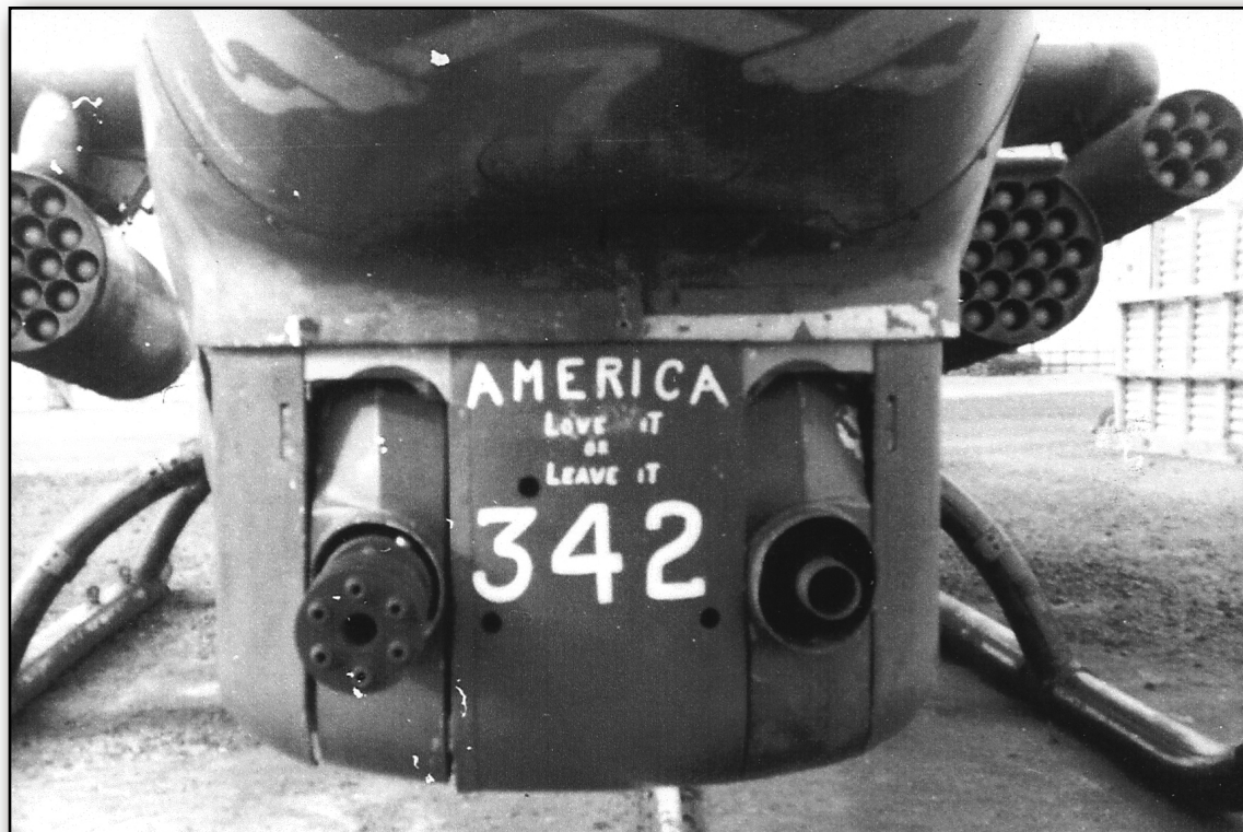
America Love It Or Leave It: C Troop 7/1 Cav, AH-1G (sn 66-15342), Vinh Long, 1968-69. Topical sentiments of the day. Including time in the 334 AWC, she flew a total of 2,448 in-country hours. art by Owen Hamiel.