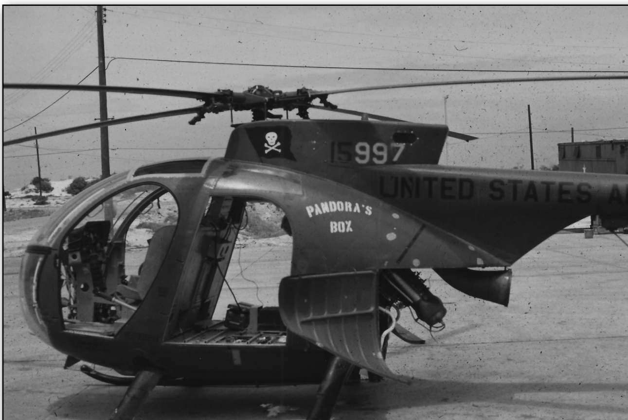
Pandora's Box: B Co 123 Avn Bn, OH-6A, (sn 69-15997), 1971, Chu Lai. An exclusive seventeen-month B-123 in-country tour netted 1,034 total flight hours before returning stateside.