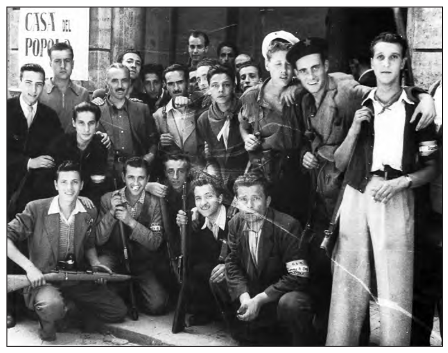
A group of proud Partisans posing near Siena and the Casa Del Popolo, which they recaptured from the Germans.