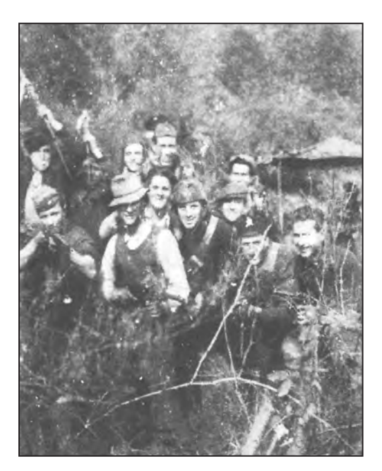
The first group of Partisans from the area of San Gimignano to join the fight against opression.

couragement of no importance as we began the climb toward the crest.