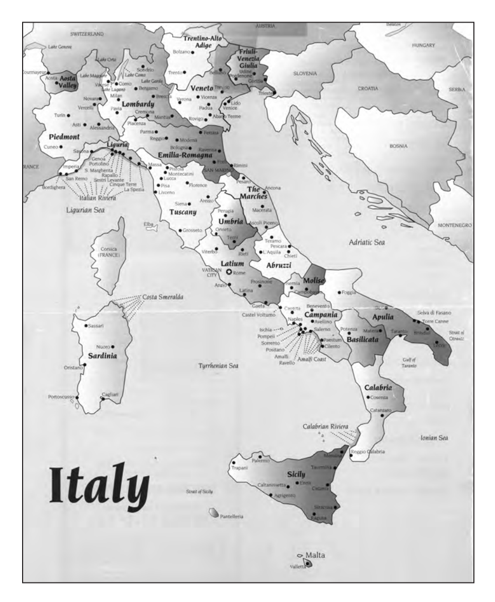
Map of Italy outlining its major provinces.